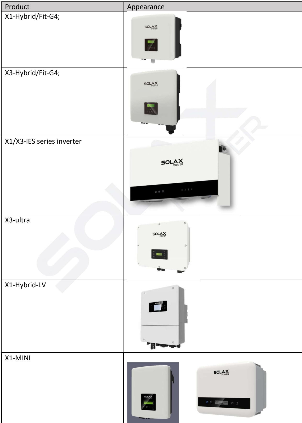
Table 3: Product and Appearance